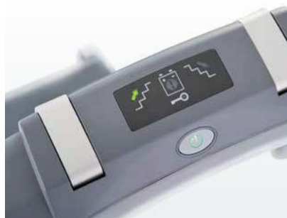
Display showing all functions at a glance