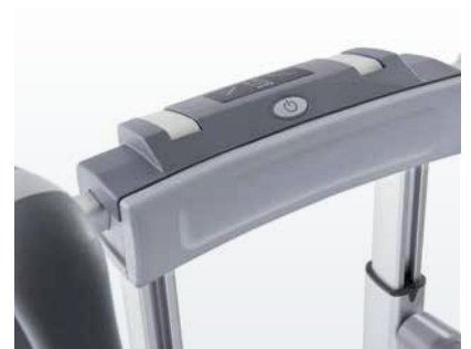
Comfortable cushioning: for resting the operating unit on the thigh