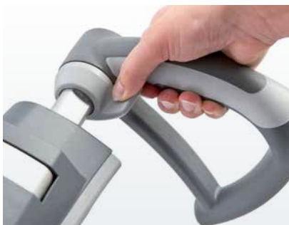
ErgoBalance handles: non-slip with a convenient shape

scalamobil and scalacombi adapt to your needs – not the other way around. The handles can be adjusted in height and width and thus adapts perfectly to the person operating it and to the stairs.