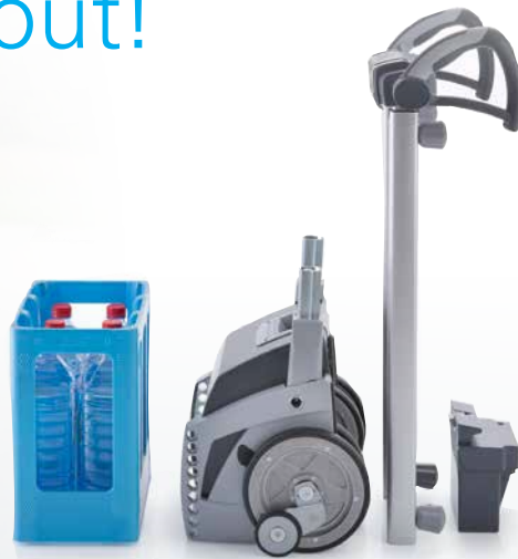
scalamobil – easy to dismantle and transport

“We can now cope with any staircase even when we’re out and about!”